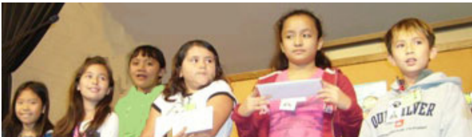
Grade 3-5 HECO Resolution Challenge honorees